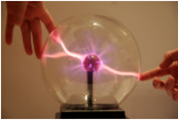
Electricity & Magnetism exhibit

There are several levels of Membership to choose from and a variety of payment methods for your convenience.